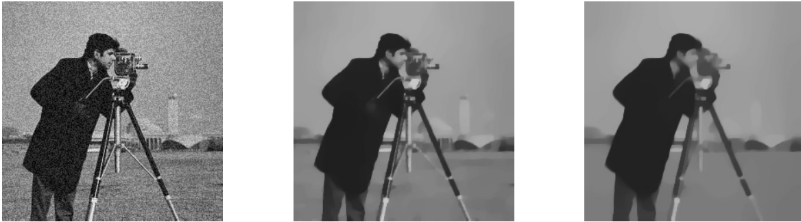
FIGURE 3. Snapshots of TV flow at time t = 0 , t = 10^{-3} , and 5 \times 10^{-3} with (\varepsilon, k, h) = (10^{-5}, 10^{-5}, 4 \times 10^{-3}) .