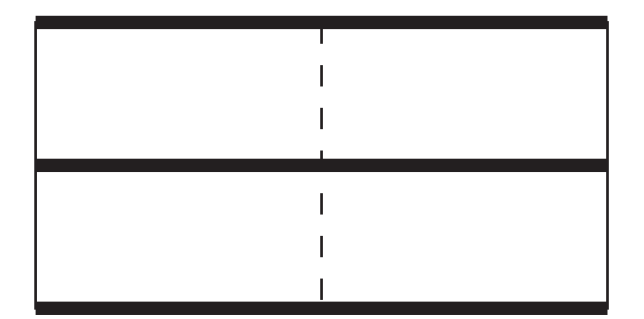
Figure 4.1. Nodal lines of \varphi_0 in \Omega .